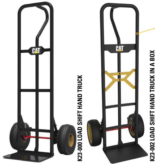
K23-000 LOAD SHIFT HAND TRUCK